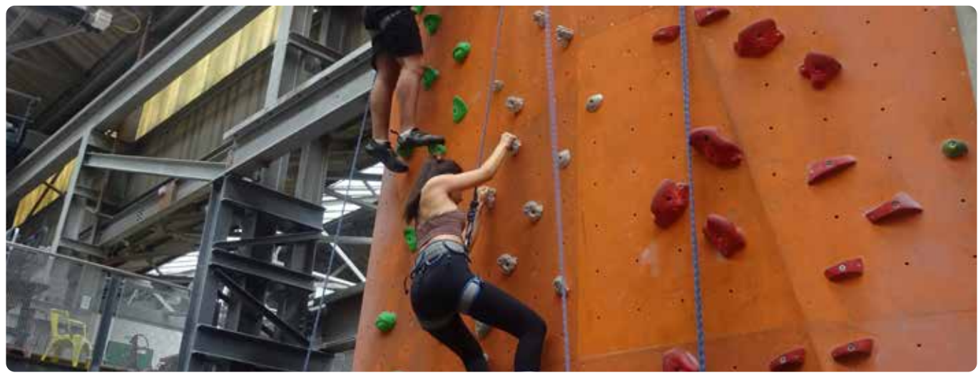
Pictures included are to illustrate the types of activities students will take part in only.

All other equipment, including safety equipment, will be provided by the activity venue. It is not necessary for students to be able to swim as life vests are provided, but students should be comfortable in and around water. Parents/ Guardians will need to complete the 'Adventure Sports Consent Form' to allow the student to take part in this course – this form will be provided by the Admissions Team.